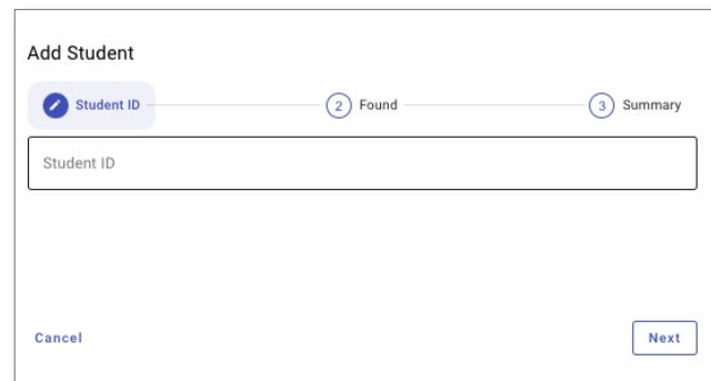
Find Your Student